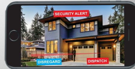
What An End-User Sees Only when/if criminal intent is detected